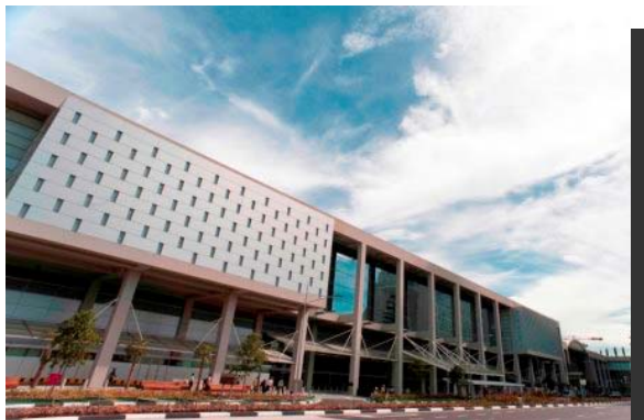
Sands Expo and Convention Center