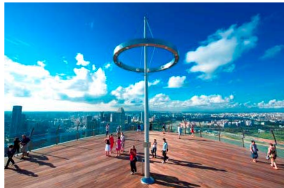
Sands Skypark Observation Deck