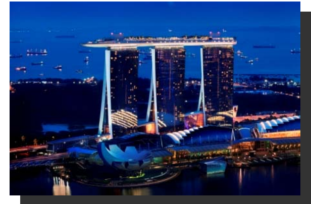
Marina Bay Sands Integrated Resort