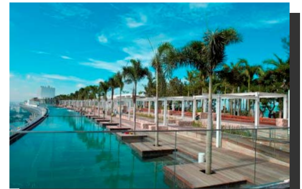
Sands Skypark Infinity Pool