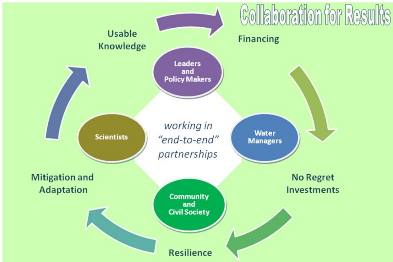
Figure 2 – Working with the 5 principles in end-to-end partnerships is necessary.

To lay the foundation for effective adaptation and mitigation efforts in the water sector, the Steering Group advises leaders in the Asia-Pacific region to support and adopt the following general principles and recommended actions in an integrated manner. Five Principles are articulated. Background information framing each Principle is presented, and two annotated actions are recommended.