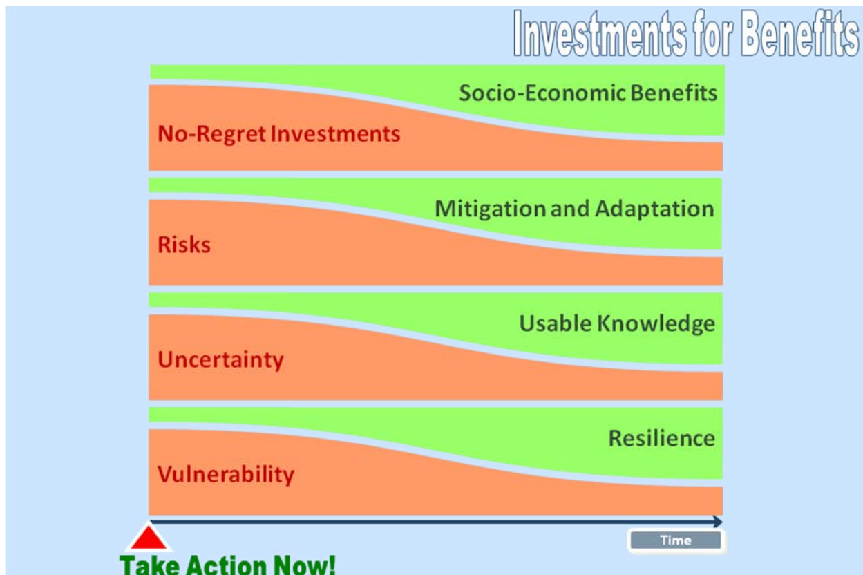
Figure 4 – No-regret investments now will ensure socio-economic benefits later on.